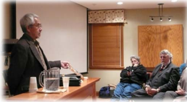
Lecture at Mir Centre for Peace.